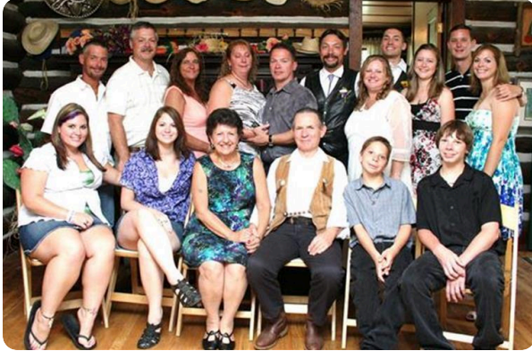
in Aug 2010

Julie Christopher shared 2 photos and a video to the New Album Name album. July 14 at 7:37 AM